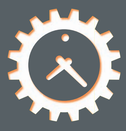
100% CAT 1 DEFECTS REPAIRED NOT EXCEEDING THE REQUIREMENTS