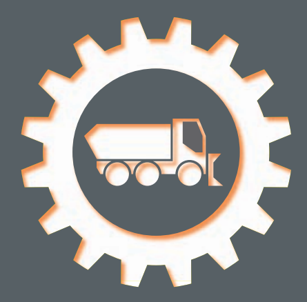
100% WINTER MAINTENANCE SALTING COMPLETED WITHIN 2 HOURS